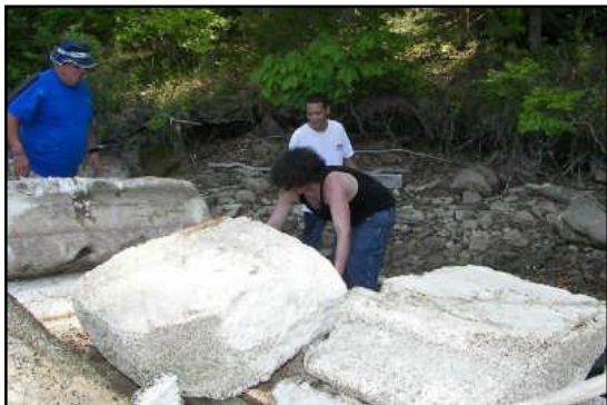
A special thanks to all of the volunteers who helped with the spring shoreline clean up. Lake wide, a total of 521 volunteers picked up over 822 cubic yards of trash—down dramatically from last spring's 1,277 cubic yards.

Business of the Year Award: This award is given in recognition of a successful business who has demonstrated ethical business practices, distinguished themselves with dedicated commitment and energetic leadership and is active in the community. This business has given service to enhance the quality of business life in the Lake area. For an application form, call the Chamber at 573-346-2227 or go to our Web site: www.camdentonchamber.com .