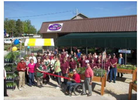
Gifted Gardens, a new greenhouse project of Lake Area Industries, recently held an official ribbon cutting to celebrate the opening of the retail store located on North Business Rt 5 across from Farris in Camdenton. Hours are 9 AM to 6 PM, Monday through Saturday, and 10 AM to 4 PM on Sundays.