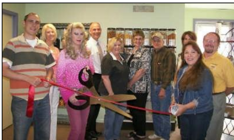
Alternative Remedies Plus is one of the Lake's Natural Vitamin and Herb Stores. We carry everything you need when it comes to Health and Beauty Supplies and Vitamin and Herb Supplements. We also carry bulk foods including bulk teas and coffee. We offer the latest in bio-information stress management technology. Energetic healthcare is the wave of the future, and the future is here today! Alternative Remedies Plus also offers a Weight Loss Program featuring Pure HCG. At Alternative Remedies Plus we are committed to providing our customers with a wide variety of services at a price that is affordable.

We have a strong commitment to supporting local growers and local artisans, so when you see an item in our store that says, "LOCAL," we truly mean it is local. Shopping locally for food, health care items, and jewelry has many benefits . . . first of all, the food, lotions, and soaps are fresher, it's better for the environment the jewelry is one of a kind and it helps to support our local economy. 980 E. Hwy 54 Suite D, Camdenton, MO 65020 . 573-346-6655 or 573-280-5651. www.AlternativeRemediesPlus.com info@AlternativeRemediesPlus.com