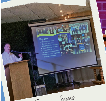
Eggs & Issues Breakfast Meetings