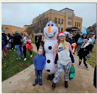
Christmas on the Square