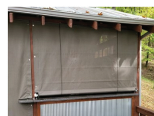
DECK & DOCK SHADES