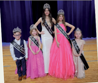
Dogwood Little's Contests