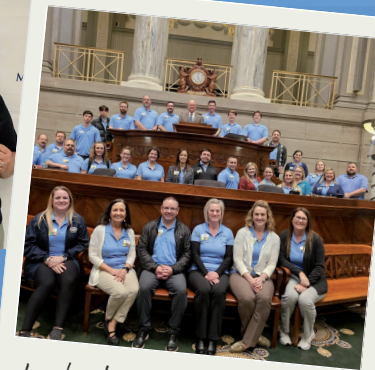
Leadership Camden County